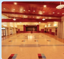
Main Event Room